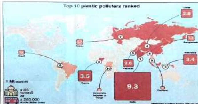
The top 10 plastic polluters in the world. The coloured boxes denote the amount of plastic waste measured in million tonnes per year. Credit: Angliki Savvastoglou, Bear Bones

"We're hoping our findings will provide national governments baseline estimates from which they could work towards reducing plastic pollution through local action plans," Ed Cook, a study co-author