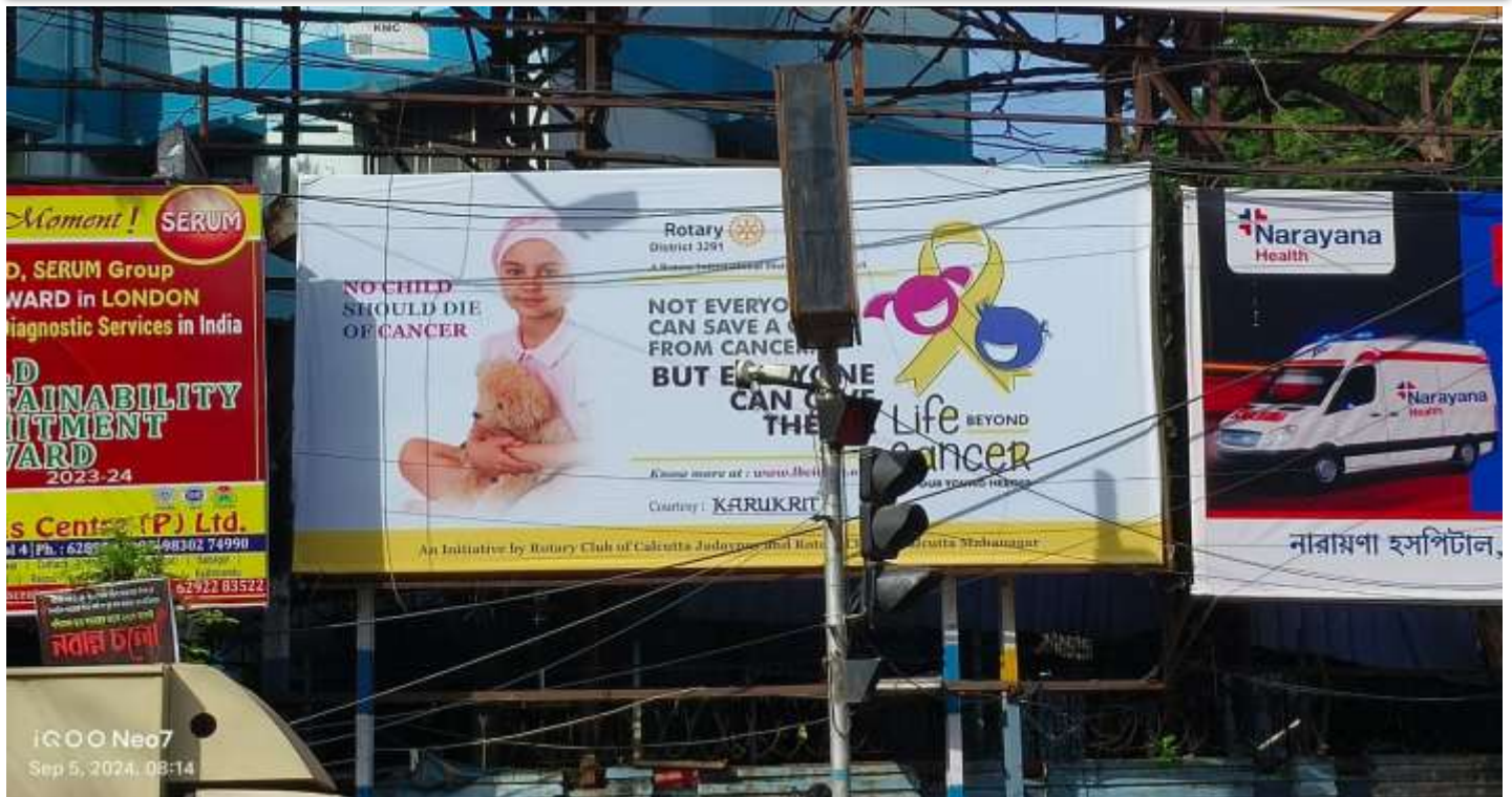
Life Beyond Cancer Hoardings in front of SSKM and Hedua, Kolkata