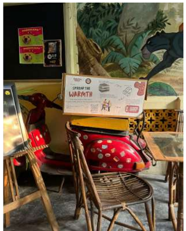
SPREAD THE WARMTH ~ Pujo garment collection drive for the needy with QUIRKY BAE